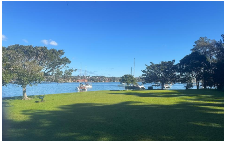
The public views from Kelly's Bush Parkland under threat

It was heartening to see so many of us gathered at the Horse Paddock on Sunday 15 June when we came together to highlight the devastating implications for this historic site. The protest even made the front page of the TWT!