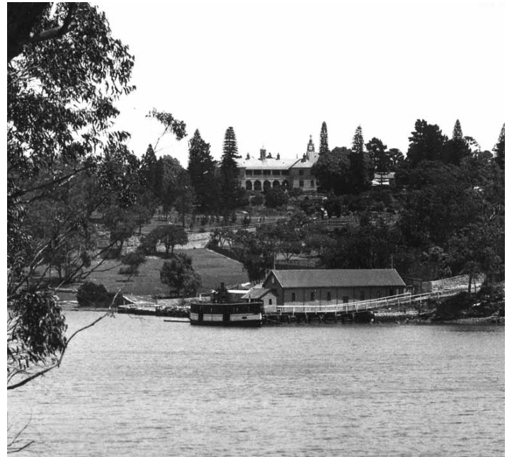
Una at Villa Maria wharf, 1915

Fairyland was an enormously popular picnic ground where hundreds of people gathered for fun. There were organised activities such as cricket, dancing, tug-o-war, sack races and egg-and-spoon races. The play equipment included boat swings, a flying fox and razzle-dazzle. The Swan family created picnic areas by planting exotic plants, including pines, phoenix palms and soft ferns. Eventually, in 1978 Fairyland became part of the Lane Cove River State Recreation Area.