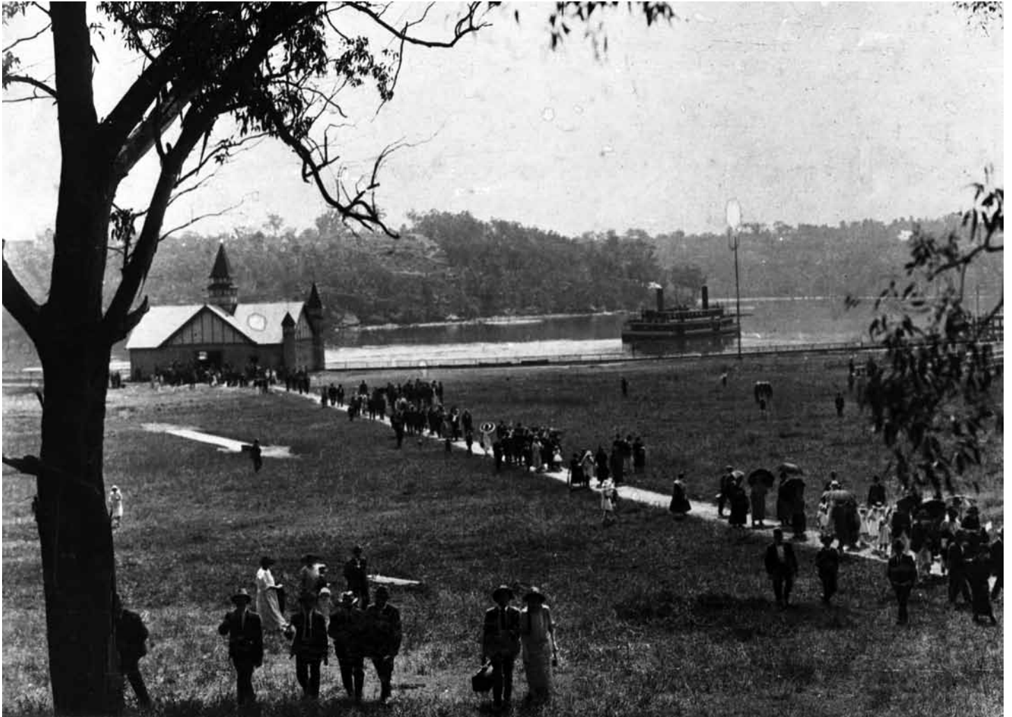
Avenue Picnic Grounds adjacent to Figtree House, circa 1920