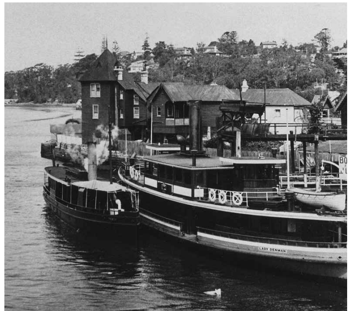
Lady Denman at the Figtree ferry depot, 1925