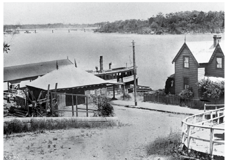
Una at the Ferry Street terminal, 1915